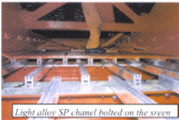
Light alloy SP chanel bolted on the screen