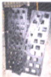
ARMACOR ® moduls