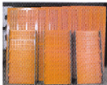
CORETANE ® SB screen pannel