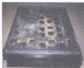
ARMACOR ® ST screen pannel