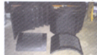
ARMACOR ® screen pannel

ARMACOR ® - CORETANE ® Efficient, cost attractif, long life time