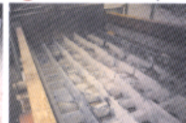
ARMACOR ® screen panels