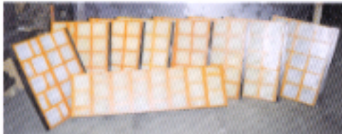
Grate for spin-dryer