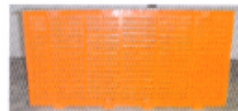
CORETANE ® SB dewatering