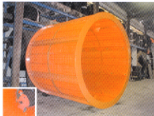
trommel screen pannel CORETANE ® SB