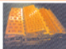
CORETANE ® moduls