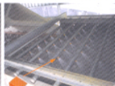
CORJET ® water jet