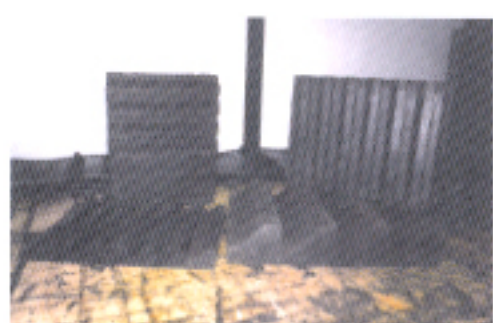
ARMACOR ® profile