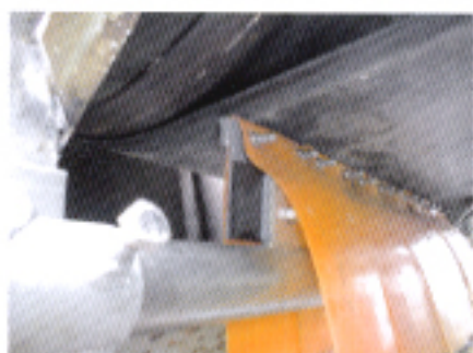
Belt scraper RCV 98 B2

CORVULCA HAS A FULL FLEDGED INSTALLATION AND SERVICE DEPARTMENT WHOSE EXPERIENCED PERSONNEL OFFER INSTALLATION SERVICES ANYWHERE IN THE WORLD.